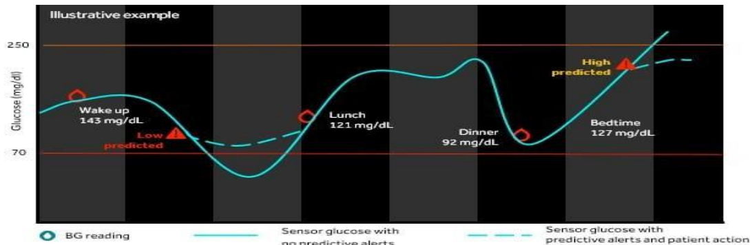
Fig.2 Continuous Monitoring of Sotagliflozin from Wake up to bed time

Although A1C is the gold standard for assessing glucose control, there are limitations to using A1C as the sole marker of effective glucose control. A1C does not capture glucose variability or day-to-day disease control. Other indices including continuous glucose monitoring (CGM) and time in range may better capture the patient experience. In addition, time in range has been associated with the risk of microvascular complications. (13)